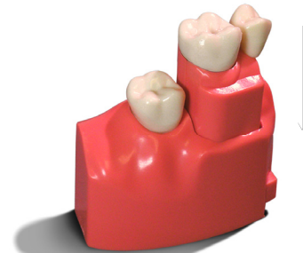
Insert the Breakaway Insert into the AE13-15 module.