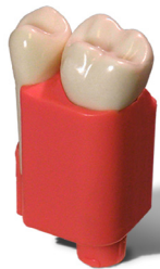
Real-T Endo tooth #14 in Breakaway Insert. (Item # RT_AE401WI_14RL)