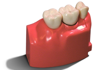
Push the Breakaway Insert until all teeth are at the same occlusal plane.