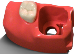
Artificial Endo Module AE13-15. (Item #RT_AE13-15)