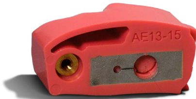
Bottom view of Artificial Endo module. To remove the Breakaway Insert, push the insert from the bottom of the module.